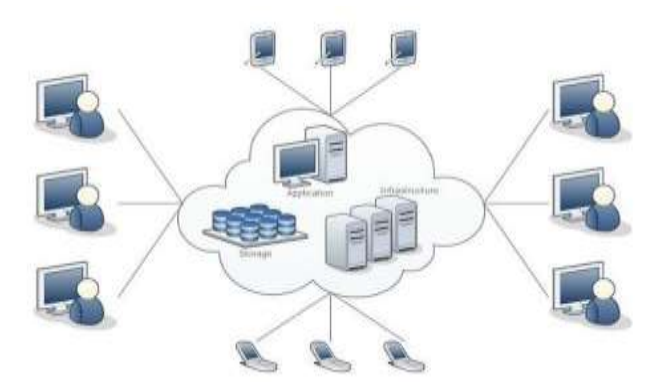
Figure 1 Cloud computing Implementation

Cloud processing contains 2 parts —the front end and the back end. The front end incorporates customer's gadgets which depends on center Java, Jsp. What's more, the backend alludes to the cloud itself. The entire cloud is managed by a focal server that is utilized to screen customer's requests (Figure 1.1).